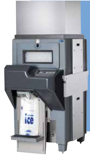
Ice Pro DB650