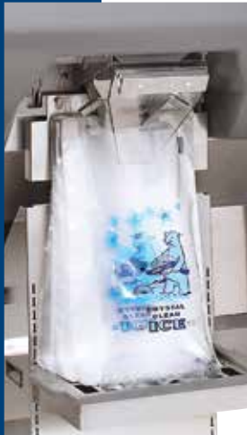
Bags are blown open