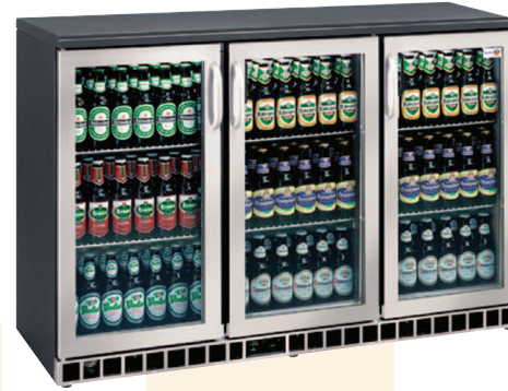
MG/275 (1200mm wide)