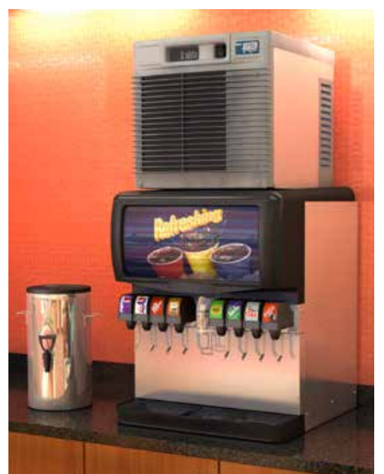
Satellite-fill remote ice delivery (RIDE), wall mount